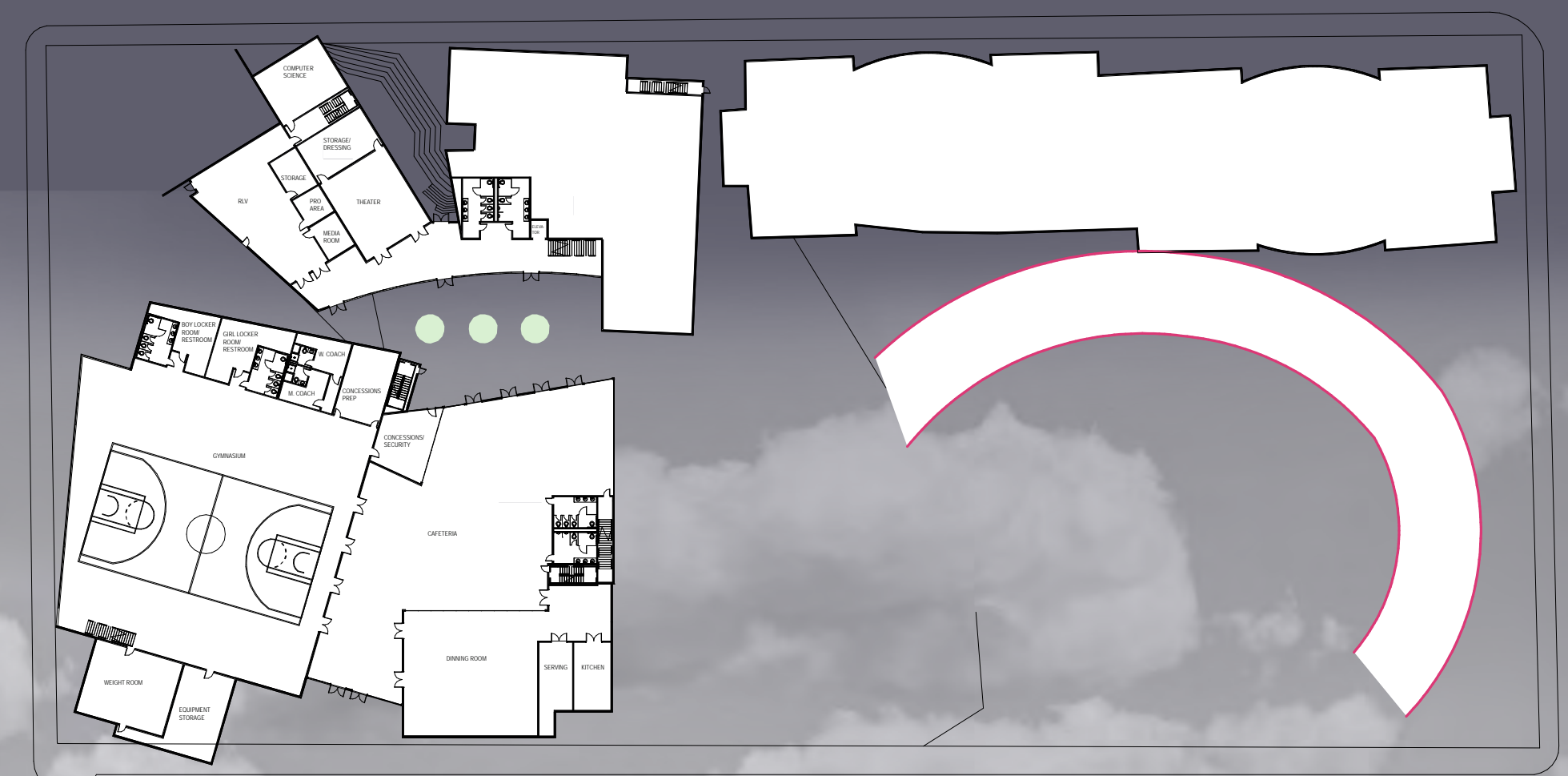
PLAZA LEVEL PLAN SCALE: 1" = 60'