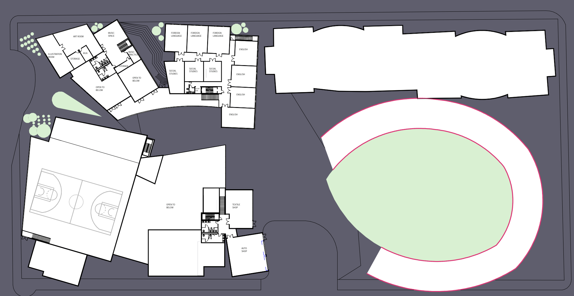
LEVEL 1 PLAN SCALE: 1" = 60'